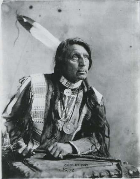
CHIEF RED SHIRT No. 19.