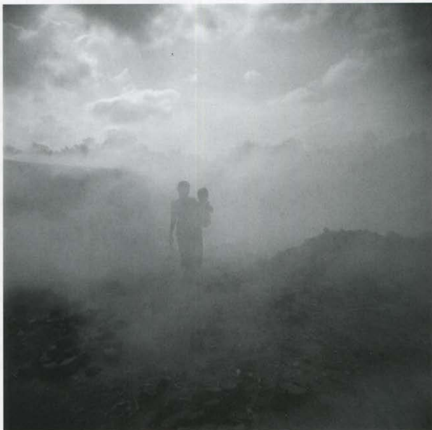
Woman in smoke, 2004-2006