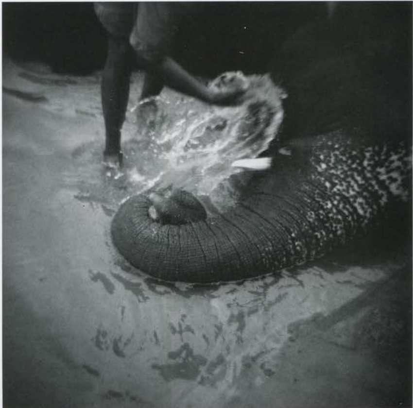
Elephant wash, 2004-2006