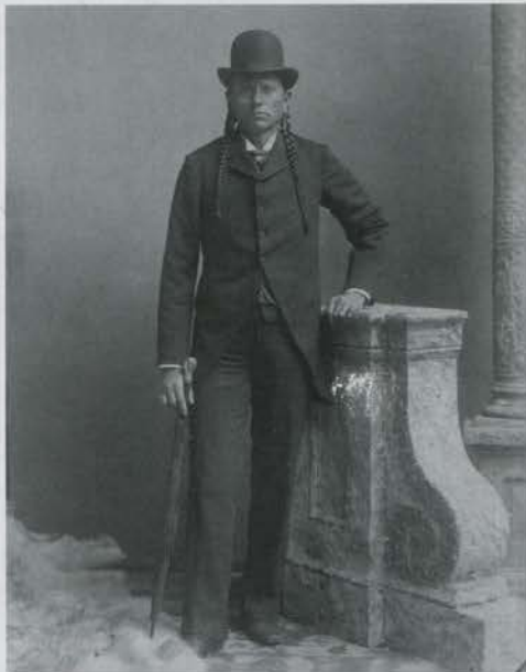
QUANAH PARKER, WASHINGTON D.C., 1880s