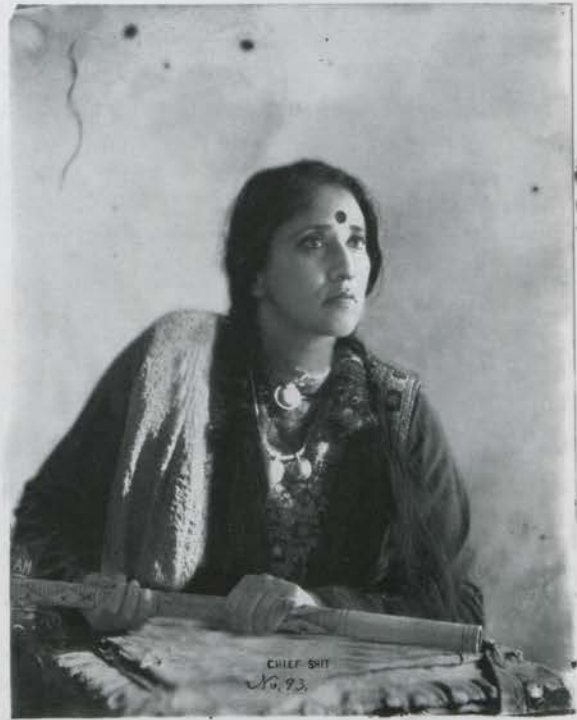
CHIEF SHIRT No. 93.