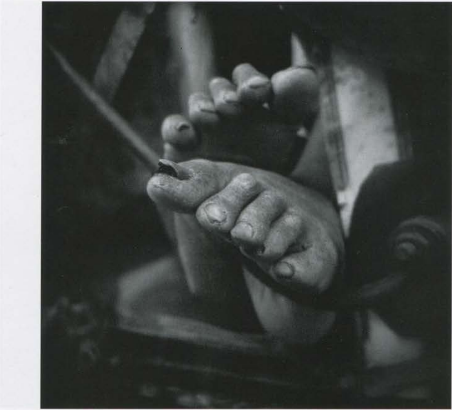
Filthy feet, 2004-2006