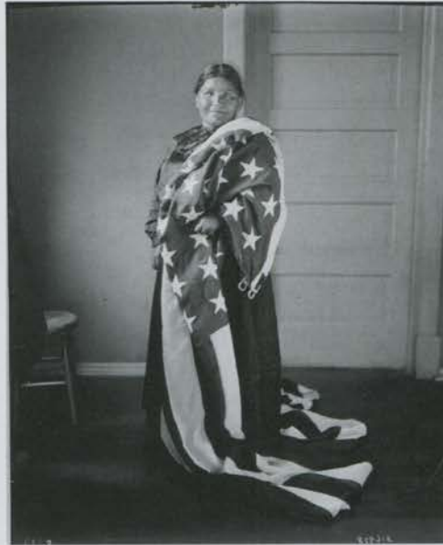
Photograph from the Wanamaker Expedition, 1913.