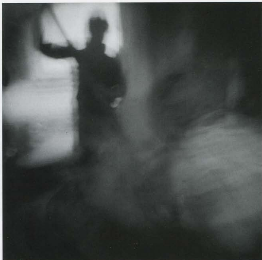
Man stirring, 2004-2006