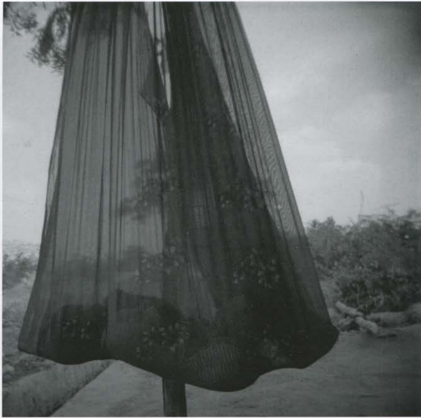
Baby sleeping, 2004-2006