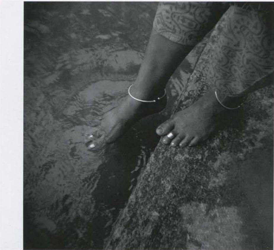
Mother's feet, 2004-2006